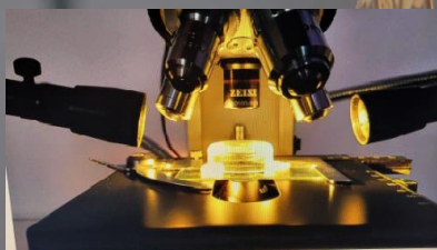
the role of advanced & primordial technology